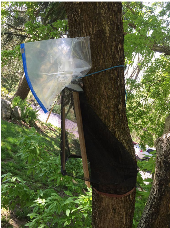
Circle trap secured to a tree.

It is almost time to use traps to protect your trees from spotted lanternflies. Get ready now so you can trap lots of spotted lanternflies safely.